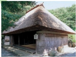
16 Nakaishi family houses This mountain farmhouse complex formerly stood on Mt. Iya, famous as the legendary refuge of the defeated Heike clan. Three thatched buildings stand in line: the main house, the elders' house, and the storehouse.