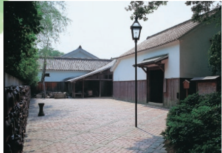
22 Soy sauce warehouse and malthouse This building was in use for many years at the brewery in Hikeda town, Okawa-gun. It now displays traditional implements, including wooden vats made in 1838 and presses, which recreate the traditional method of brewing soy sauce.