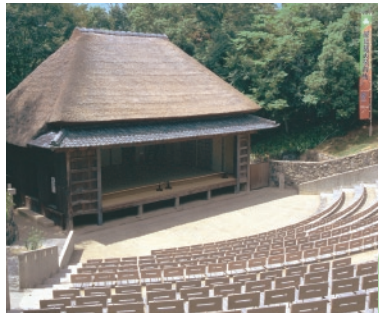
3 Shodoshima Farmers' Kabuki Theater This kabuki theater comes from the village of Obu on Shodoshima Island. Farmers' kabuki theaters are common throughout Shikoku. During festivals the villagers could take a break from their backbreaking labor and amuse themselves by watching kabuki performances.