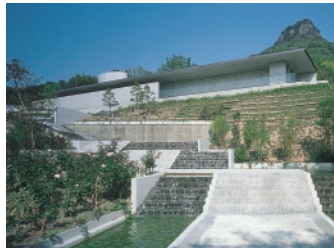
Shikoku-Mura Gallery The gallery exhibits a wide range of artworks including paintings, sculptures, Buddha figures, bronzes and calligraphy. The building and its inner water garden were designed by architect Tadao Ando.

Experience for yourself at Shikoku-Mura how life in times past was imbued with the wisdom of our ancestors. Thirty-three traditional buildings from all over Shikoku have been reconstructed in their original forms, and are placed here and there throughout the village. Take the time to stand and gaze a little as you stroll from one to another, and encounter the almost-forgotten past of traditional Japan.