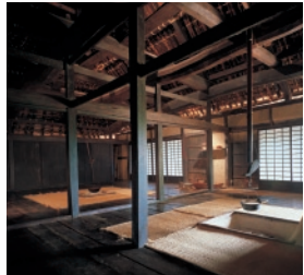
13 Shimoki family house This farmhouse formerly stood in Ichi village on the northern slopes of Mt. Tsurugi. Its construction features broad beams that cross each other to create a powerfully attractive space.