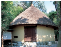
6 Sugar cane press An ox would be yoked to a beam that turned the millstones in the center of the hut to grind the sugar cane. The hut is therefore circular in construction.