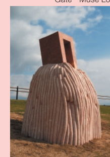
Toru Saito, Sky and Earth "Circulation 2009"