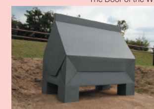
Katsumi Naganuma, Marine Capital of the Seto Inland Sea (four-door)

Transport Access 20 min. by car from the Takamatsu-chuo IC 15 min. by car from the Sanuki-Miki IC 50 min. by car from Takamatsu Airport 15 min. on foot from Sanuki Mure Station on the JR Kotoku Line 3 min. on foot from Fusazaki Station on the Kotoden Shido Line 7 min. on foot from Shioya Station on the Kotoden Shido Line